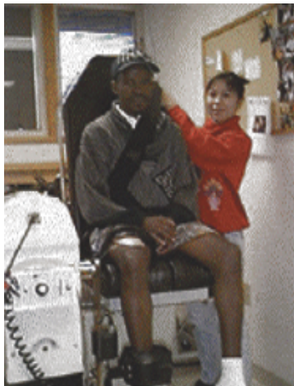
Testing knee performance